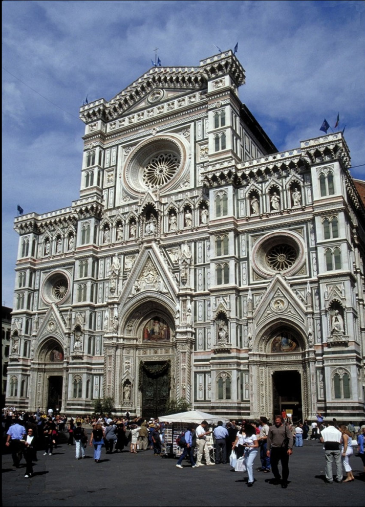
Santa Maria dei Fiori, aka , il Duomo di Firenze (begun c. 1296)