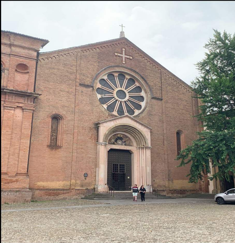
Basilica di San Domenico in Bologna.