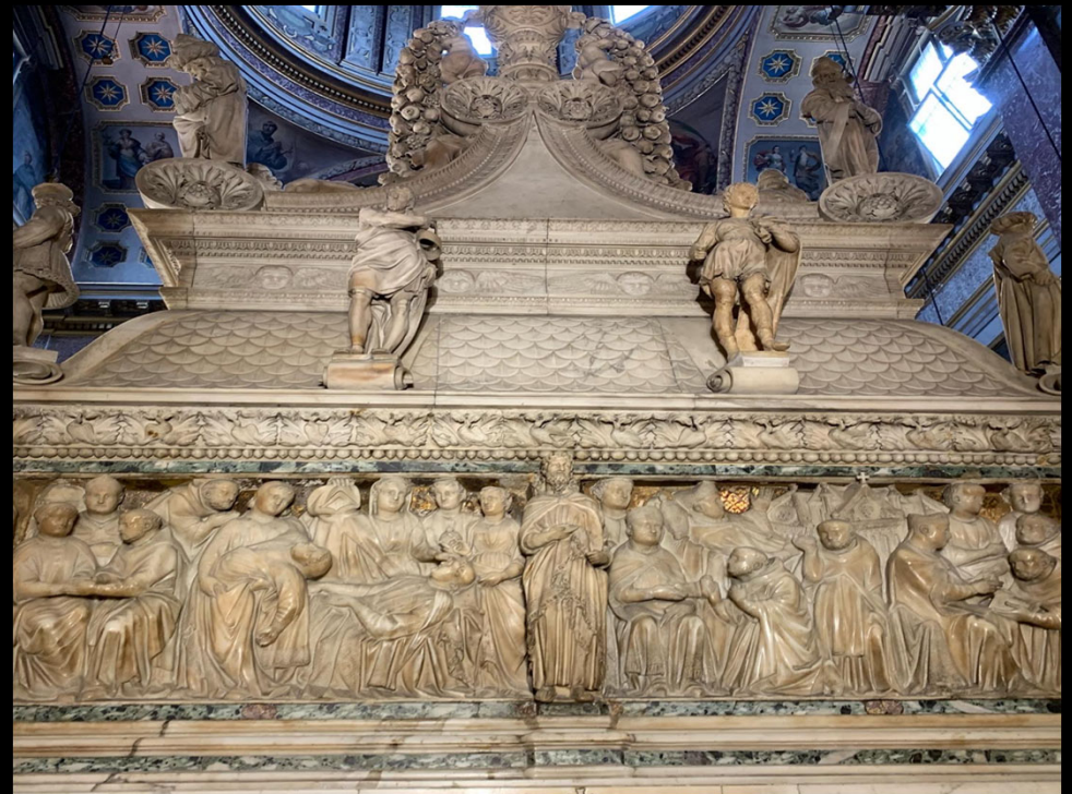
The arca of St. Dominic in Bologna.